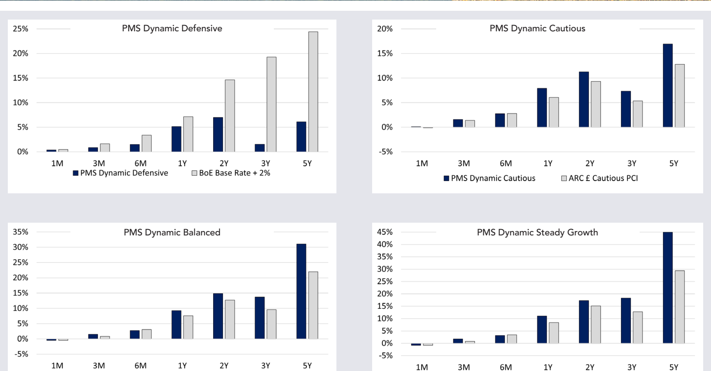
■ PMS Dynamic Steady Growth ■ ARC £ Steady Growth PCI